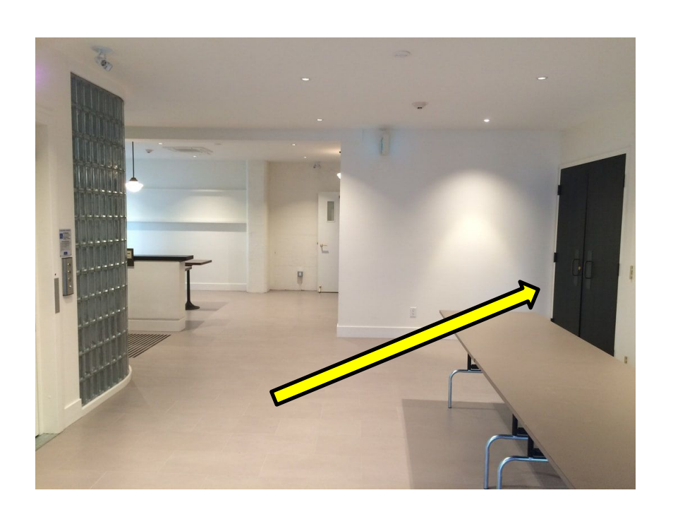
To go into the hall from the lobby, you walk through these doors. Often there will be someone to take or scan your ticket.