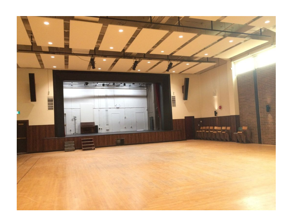
This is what it looks like when you walk in and the Hall is empty.